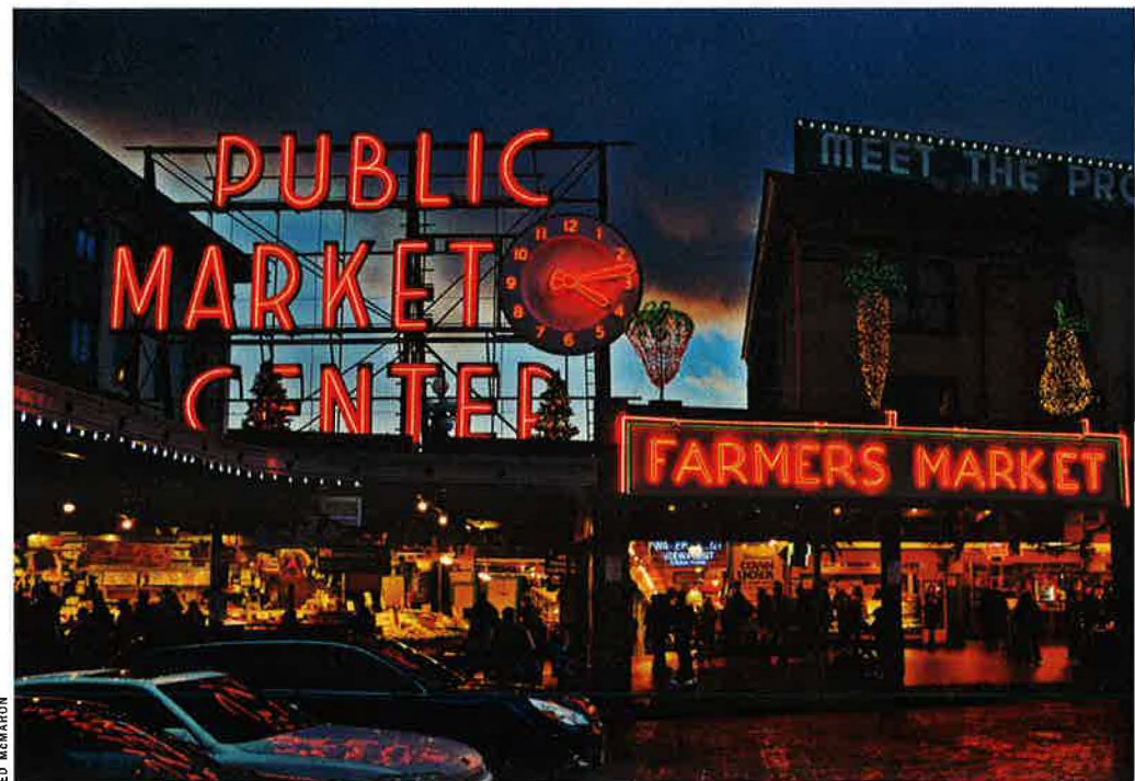
Pike Place Market in Seattle, Washington.

2. Focus on the authentic. Communities should make every effort to preserve the authentic aspects of local heritage and culture, including food, art, music, handicrafts, architecture, landscape, and traditions. Sustainable tourism emphasizes the real over the artificial. It recognizes that