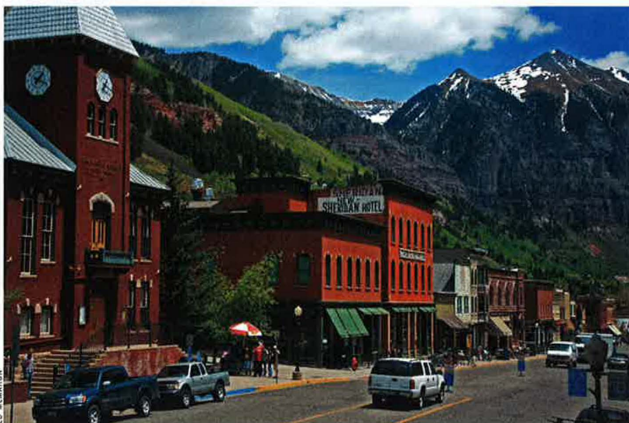
Promoting tourism means protecting authentic destinations, such as Telluride, Colorado.